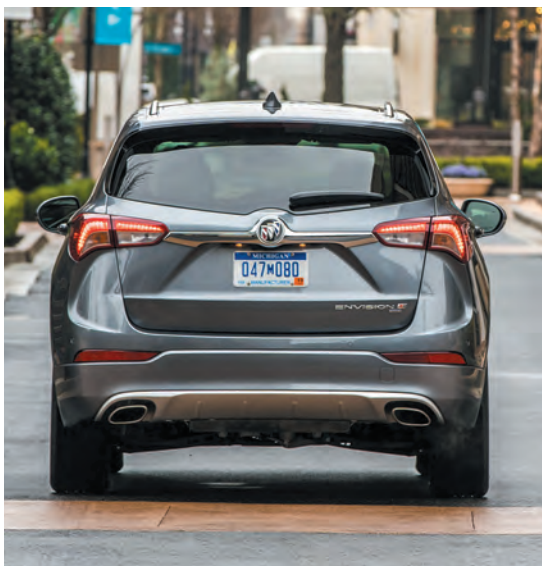
⬆ Buick Envision

1 Only four-wheel-drive vehicles with a two-speed transfer case that has a Neutral and a four-wheel-drive low setting can be flat towed. Disconnect the negative battery cable at the battery and secure the nut and bolt. Cover the negative battery post with nonconductive material to prevent contact with the negative battery terminal. Use of a shield mounted in front of the vehicle grille could restrict airflow and damage the transmission.