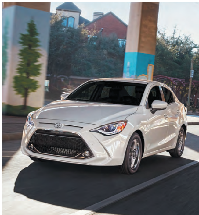
↑ Toyota Yaris