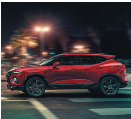
↑ Chevrolet Blazer