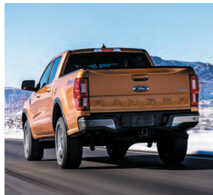
↑ Ford Ranger

The accompanying charts include approximate curb weights as supplied by the manufacturers; however, optional equipment and accessories can increase the weight of the vehicle. So, make sure that its weight will not push the combined weight above the GCWR. It's also a good idea to weigh your motorhome (see "Weighing Your RV" July 2014, page 40). Because of overloading issues, some motorhomes should not tow anything. In fact, certain motorhomes may need to have their loads lightened before being driven solo.