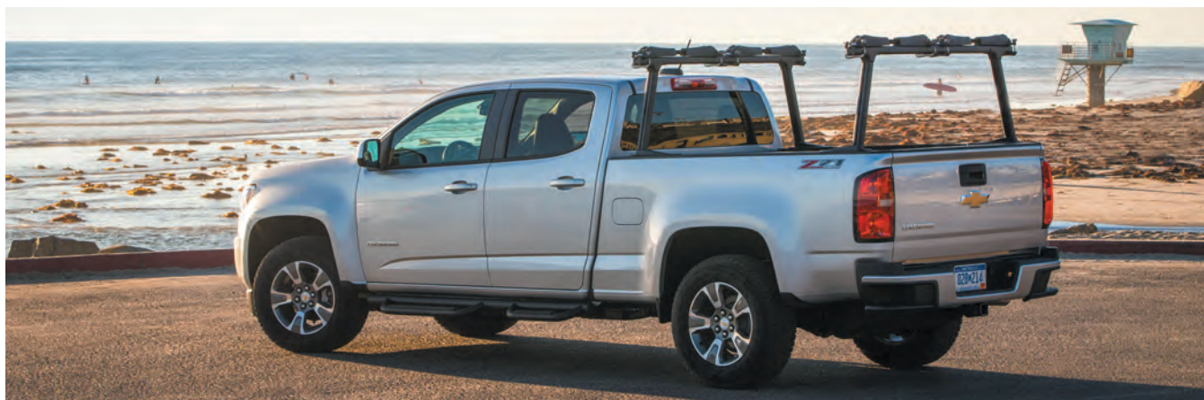
↑ Chevrolet Colorado