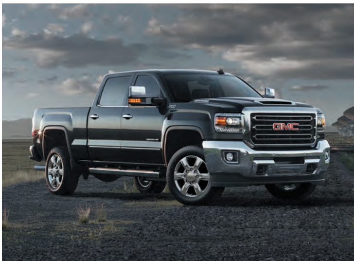
↑ GMC Sierra 1500