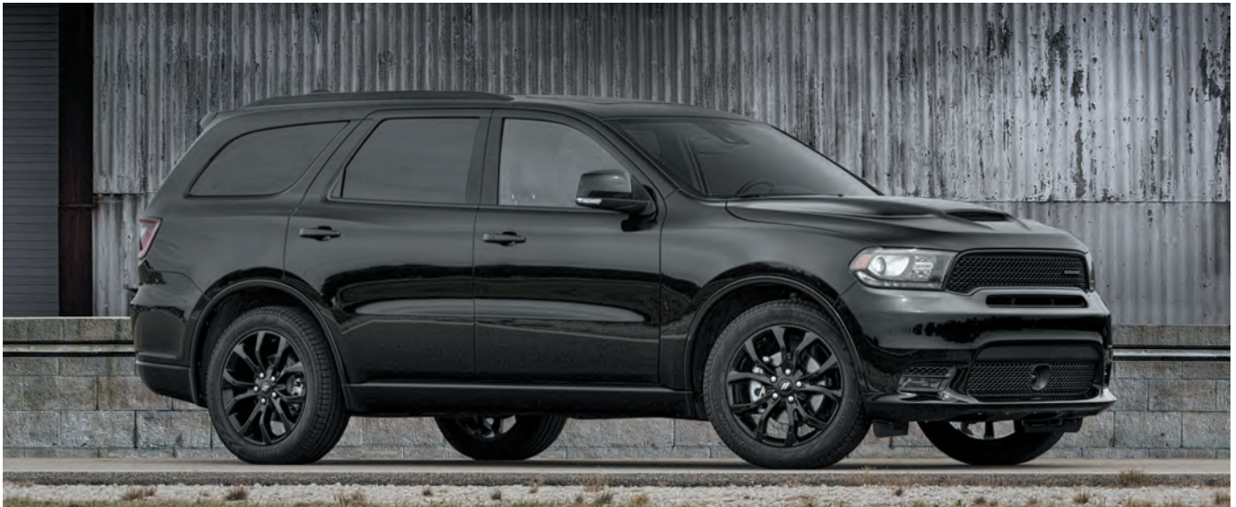
↑ Dodge Durango