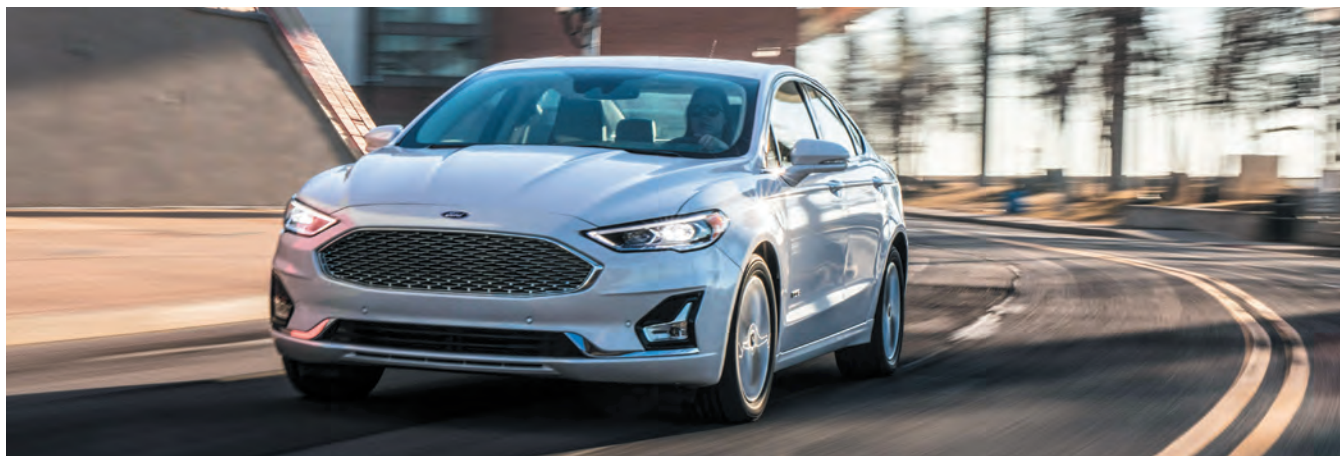
↑ Ford Fusion