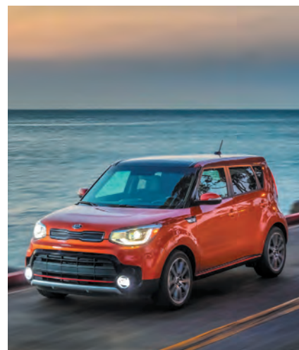
↑ Kia Soul