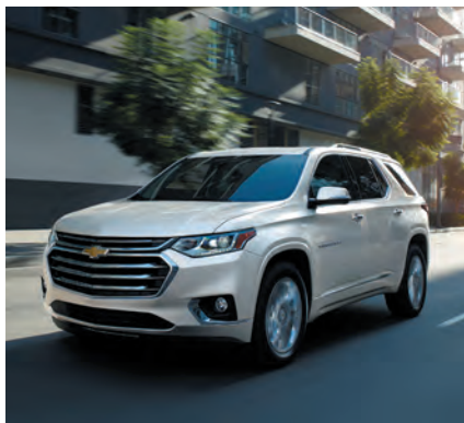
↑ Chevrolet Traverse