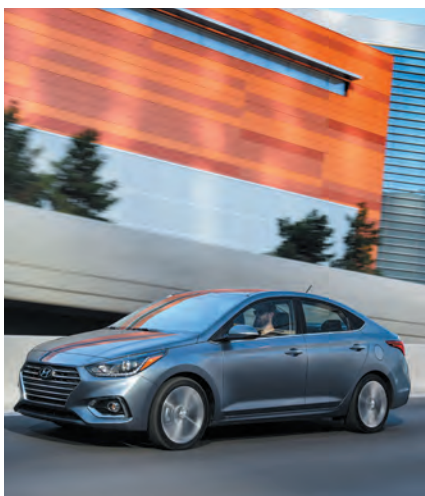
↑ Hyundai Accent