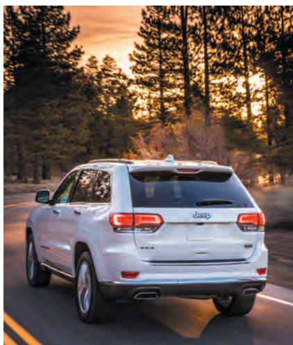
↑ Jeep Grand Cherokee