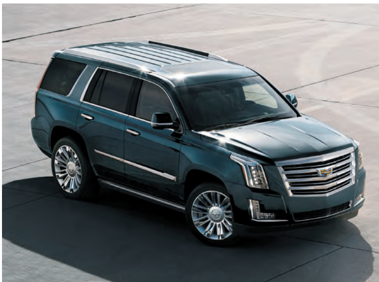
⬆ Cadillac Escalade