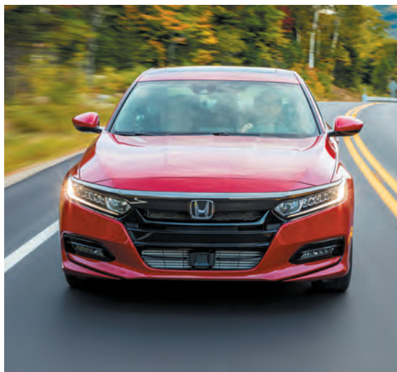
↑ Honda Accord Sport 2.0T