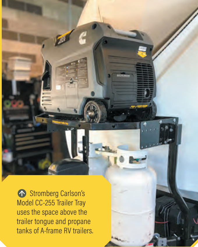
↑ Stromberg Carlson's Model CC-255 Trailer Tray uses the space above the trailer tongue and propane tanks of A-frame RV trailers.